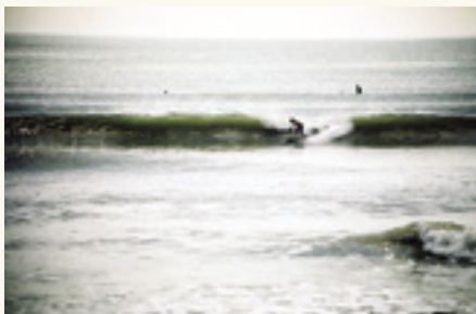
Swell from Hurricane Ivan made for some fun waves at Surfside, Texas.

As part of their ongoing Texas Open Beaches Act Campaign, the Texas Chapter has issued public position statements on several issues affecting their state's coasts. One such coastal armoring issue is the use of "geotextile tubes" which is detrimental to healthy coastal process. Although some advocate coastal armoring and geotextile tubes as a solution to erosion, the fact is that "hard structures" are a cause of increased shoreline erosion. To put it simply, dunes protect the shoreline by absorbing the erosive energy of waves. Dunes, being irregularly shaped, reflect and refract incoming waves in a changing and random pattern. Sand picked up by incoming waves absorbs wave energy. Movement of the sand and dunes by waves and storms protects the land and minimizes erosion naturally.