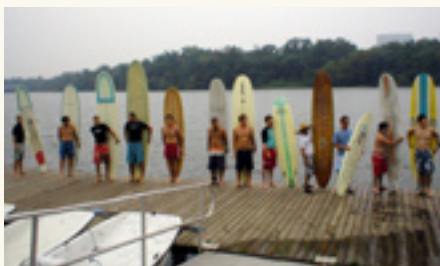
Above top: A Capitol Chapter activist gets his scream on at a recent tabling event. Above: Capitol Chapter activists prepare to hit the icy Patomac River for their annual Paddle For Clean Water event.

"It must have seemed a strange sight to the joggers on the Key Bridge: 13 surfers bobbing on the ever-so-slightly rippled waters of the Potomac," read the headline in a recent WashingtonPost.com article entitled the "Dudes of Clean Water." Surfrider Foundation's Washington D.C., Capitol Chapter marked their annual Clean Water Day Paddle Out highlighting the need for strong coastal conservation, legislation and awareness. On the shore, chapter activists showed off a surfboard signed by scores of members of the House of Representatives that marked the passage of BEACH Act of 2000, which required states to adopt minimum water quality standards. But even with this act, additional measures are needed as identified by the U.S. Commission on Ocean Policy Report and PEW Oceans Report.