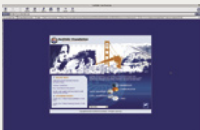
The judges were impressed by the clean and stylish layout of the San Francisco Chapter's website.

With its dazzling animation and wealth of information, Malibu was unanimously voted the top website of the year. San Francisco also garnered rave reviews for successfully capturing and incorporating the cultural flavor of the "City by the Bay" within the site. Massachusetts, Newport Beach and Eastern Long Island all received notable mention as well.