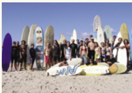
The Eastern Long Island Chapter gets ready to take part in the national Paddle For Clean Water.

Maryland's Ocean City Chapter is continuing its pet project: surf site stewardship; welcoming their newest partner, the Barefoot Mailman Motel, which will be taking up stewardship of the beach and break at 36th Street. The motel joins five other organizations which signed on to the program last year.