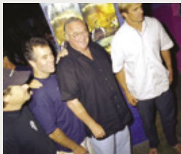
(L to R): Stacy Peralta, Jeff Clark, Greg Noll, Laird Hamilton at the NYC Riding Giants event.