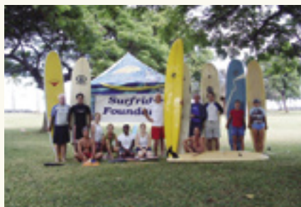
The Eastern Long Island Chapter gets ready to take part in the national Paddle For Clean Water.

Oahu residents have paid for millions of dollars in improvements to the plant that are ready to be utilized, but sit idle while the city wrestles in a legal battle with the contractor who did the work. The Oahu Chapter's efforts are a continual process, which demands the support of volunteers, members and residents of Oahu, so please contact them if you'd like to get involved in this campaign and others.