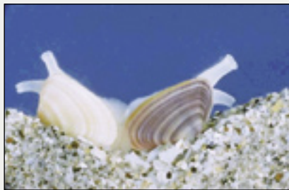
Mole crabs (top) and coquinas (bottom) are integral parts of the near shore food chain.

Immediately offshore, sandy or reef bottoms are also buried from 100-200 feet out. In Florida, shallow nearshore reefs that are federally designated as Essential Fish Habitats are still directly buried. Over 325 species of invertebrates alone have been identified on nearshore reefs buried by renourishment dredging. This includes living colonies of star corals, fire corals, and large numbers of other attached or cryptic species. In terms of fishes, the numbers at a south Florida site where 12 acres of reef were buried decreased by 95%. The abundance declines at the burial site were present 18 months after impact. Eighty percent of the individuals were early life stages, indicating that the buried nearshore reefs are nursery habitats for small life stages that can’t simply swim away when their habitat is buried. These and other studies have now identified over 200 species of fishes associated